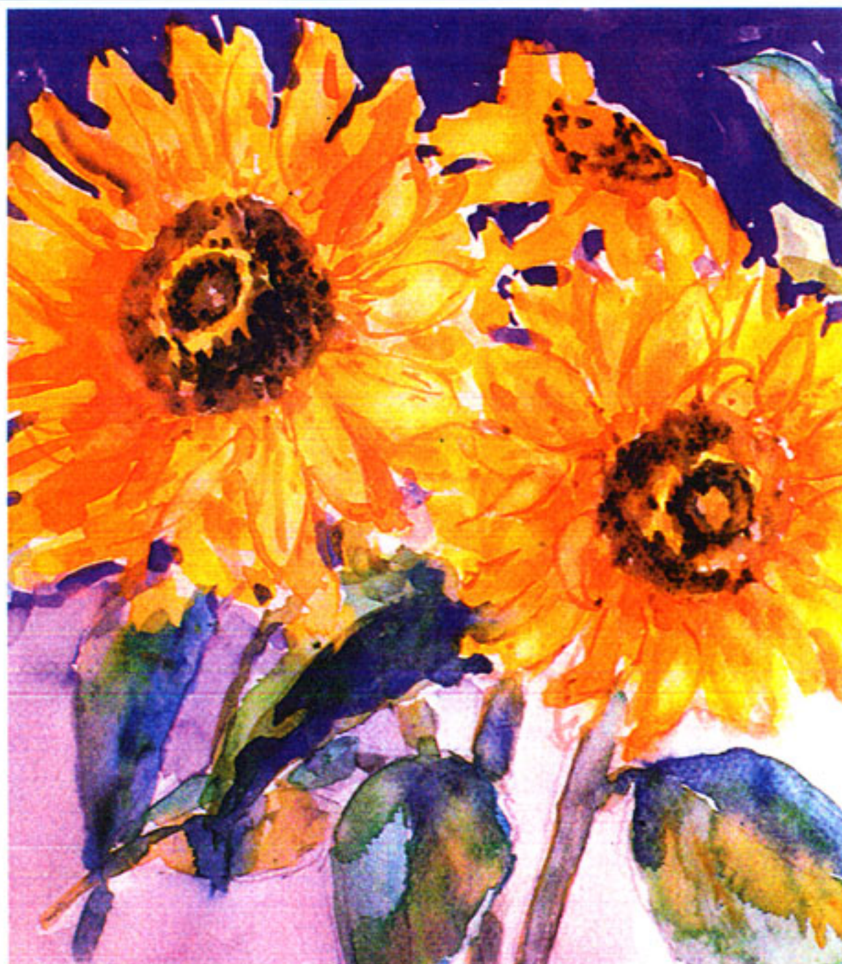
COVER ART: NARSAD ARTWORKS